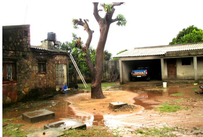
Leo's back yard