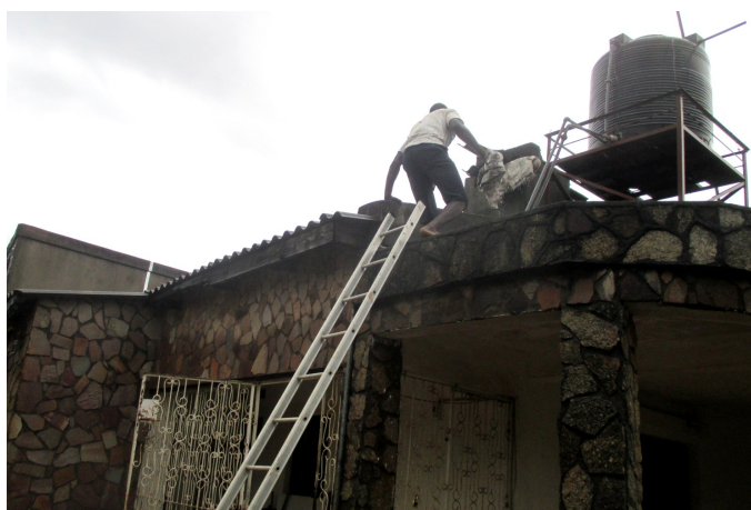
Roof repair beginning on Leo's home/office