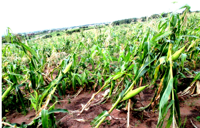
Please pray some of Leo's corn crop can be salvaged