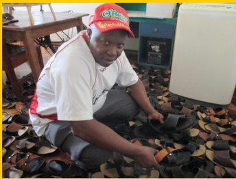
Just a few of the shoes being made at Leo's shoe factory