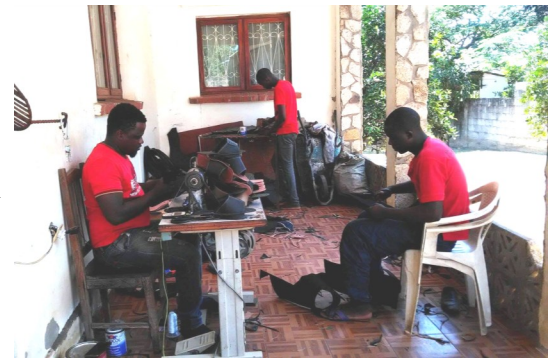
Leo's shoe factory

The cost of building the structures on this property will be approximately 180,000.00 USD. This will include a well with pump, Electricity hook up, phone hookup, plumbing the house for kitchen and bathrooms, wiring the house, buying bathroom fixtures for the bathrooms, and kitchen fixtures. The shop/storage building will have electric and water as well. We will also build a loading dock to provide a secure place to unload containers. This dock will also be used to export shoes to other countries in the future. The sales are going on already in these countries. The volume is developing as we are growing.