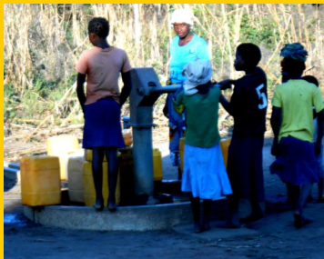
A 'bore hole' (water well) much like one needed at the new compound

Mailing Address PO Box 2937, Mills, WY 82644