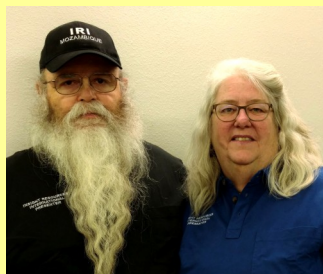
Coveting your prayers and thanking you for your support