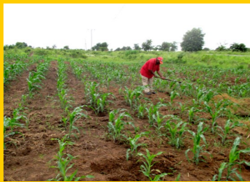
This year's corn crop

Mailing Address PO Box 2937, Mills, WY 82644