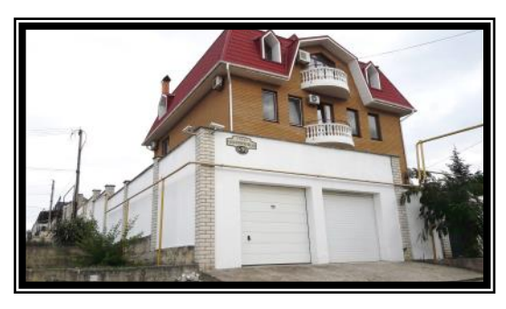
"The House on the Hill" Ministry & Outreach center