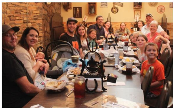
Most of the Lawrence family!