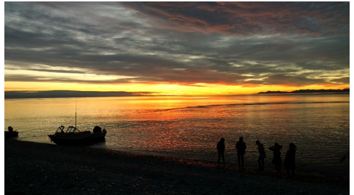
Sunset in Nome