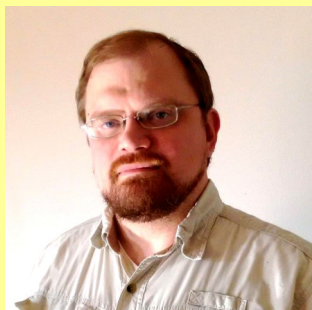
Coveting your prayers and thanking you for your support

AL will be at home w/ Velma as she recovers.