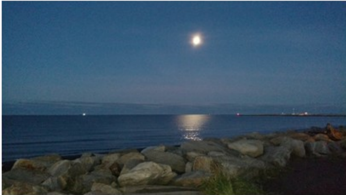
Sunrise (6 am)

And now some photos from our recent trip.