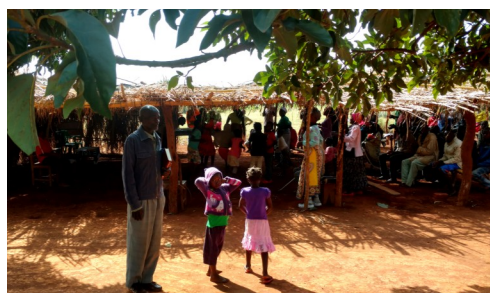
The Macate Church