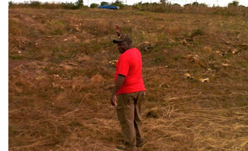
Farm land near the airport—the site of the future headquarters