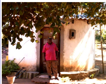
Office hut at Selva

Leonard also has several areas of farmland near Chimoio that are used to raise corn and other crops for sale to local villages. These projects not only help in the ways we've already discussed, but also supplements the food these local villages have, reducing the amount of starvation in the region. During my trip, I was able to visit three of the main agricultural projects Leonard is heading up. One property, which is located near the Chimoio airport, is also the proposed site of IRI Mozambique's future headquarters. Once complete, the airport compound will serve as a home for Leonard, a training center, a stopping place for visiting pastors and students, along with any other functions Leonard thinks it needs to perform. Another property is in Selva, and I was able to meet both the Mozambicans who run the farm, and some of the local villagers and community leaders. Everyone was very excited about the possibilities for the farm, as Leonard has been working on steadily improving the land for the benefit of the local village as well as the work IRI is doing. There is one building on the property that the locals have designated as a local office for IRI.