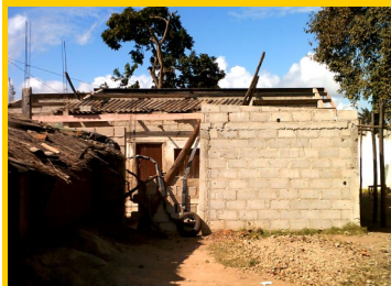
Shoe shop under construction