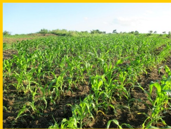
One of Leo's corn Fields. . . .