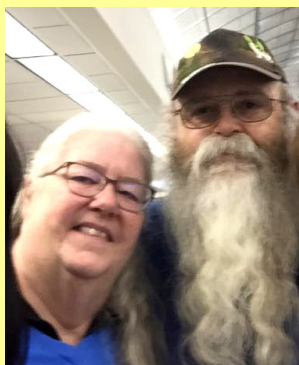
Coveting your prayers and thanking you for your support