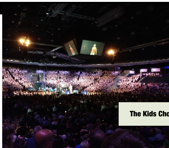
The Kids Choir

The director thought in 2007 when he started it that maybe 2000 to 4000 would sign up but that very first year 28,000 signed up. It grew from our area to the whole state of Lower