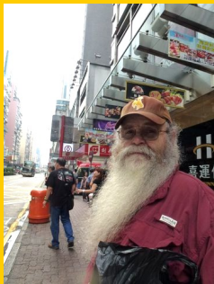
Al on the streets of Hong Kong

Mailing Address PO Box 2937, Mills, WY 82644